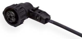
Ready-made cable Type FL33X33X 3 x 0,75 mm 2 with 4-pin bayonet ISO 15170 90° angle