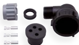
3-pin connector M 27 x 1 90° angle for corrugated tubing NW10