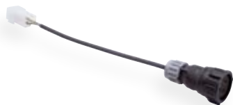
Ready-made cable Type FL33X33X 3 x 0,75 mm 2 with 3-pin bayonet connector 16 S straight