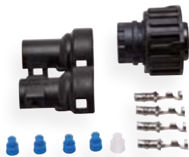
4-pin bayonet ISO 15170 straight connector for corrugated tubing NW10