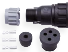
3-pin connector M 27 x 1 straight for cable