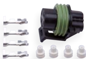
4-pin Packard connector Metri Pack