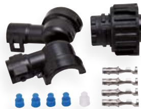
4-pin bayonet ISO 15170 90° angle for corrugated tubing NW10