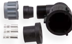
3-pin bayonet 16 S 90° angle for cable