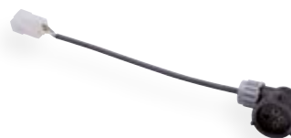
Ready-made cable Type FL33X33X 3 x 0,75 mm 2 with 3-pin bayonet connector 16 S 90° angle