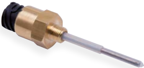
Level monitoring sensor with sensing pin 80 mm long