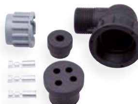
3-pin connector M 27 x 1 90° angle for cable