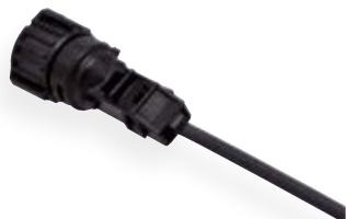
Ready-made cable Type FL33X33X 3 x 0,75 mm 2 with 4-pin bayonet ISO 15170 straight connector