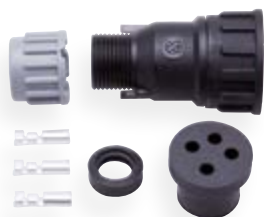
3-pin connector M 27 x 1 straight for corrugated tubing NW10