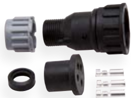
3-pin bayonet 16 S straight connector for corrugated tubing NW10