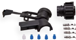
4-pin bayonet ISO 15170 90° angle for cable