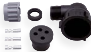
3-pin bayonet connector 16 S 90° angle for corrugated tubing NW10