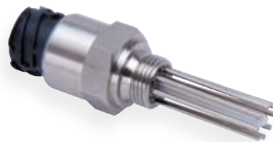
Level monitoring sensors for high-viscous oils