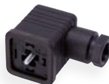
3-pin plug with centralized screw M 3 x 35 DIN EN 175 301-803-A