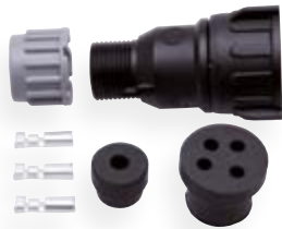
3-pin bayonet 16 S straight connector for cable