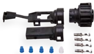
4-pin bayonet ISO 15170 straight connector for cable